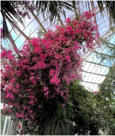
Bougainvilleas climbing to the roof

the glasshouse. Charles Darwin, Carl Linnaeus, Prince Henry the Navigator, Christopher Columbus, Captain James Cook, Gerardus Mercator, John Parkinson and André le Nôtre, were chosen to represent the Victorian passion for exploration, scientific discovery and learning. Views change. Three of the people