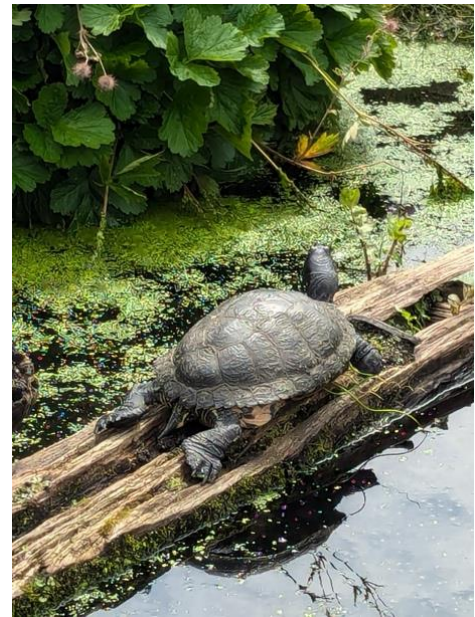
One of the rescued turtles

One of the other ponds is home to 17 rescued turtles who like to feast on Spam or hot dog sausages. Worth noting that turtles make an excellent alternative to pond fish as they are completely heron proof.