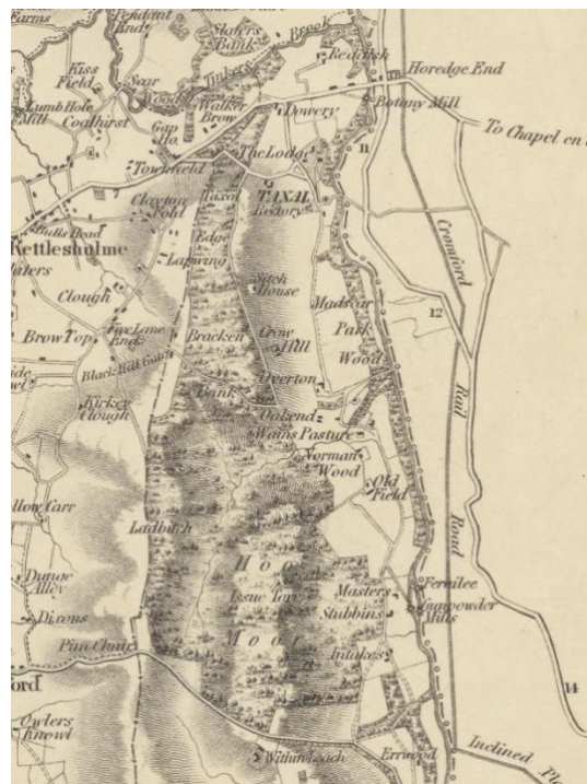
Map of Cheshire by Bryant surveyed between 1829 and 1831

In total, White had been paid £3,007 by 6 September 1798 but was this just for the planting contract of the 1,000 acres of moorland? Taxal Lodge, when advertised for rent in 1796 (Manchester Mercury, 29 March), was described as 'newly built' with '(kitchen) Garden...and any Quantity of Land not exceeding 50 acres'. By 1831, it had extensive pleasure grounds (Macclesfield Courier and Herald, 8 October) that can be seen on the sale plan (below).