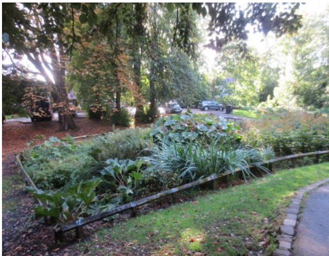
The bog garden, previously a fish pond

Originally a mediaeval deer park, the estate comprised almost 2000 acres. Little remains from that time, when there was a productive garden, an orchard, and a fish pond, now the site of a bog garden (left). The walled kitchen garden was the work of William Davenport 10 th (1767 – 1829) . At this time the wider parkland area had groups of trees; some beech trees from this time remain. A ha ha was built to retain a garden field. This later became a bowling green and then a steep lawn sweeping down to the middle pond. Ornamental shrubberies flanked the hall. The main drive at this time crossed the parkland to Bramall Green.