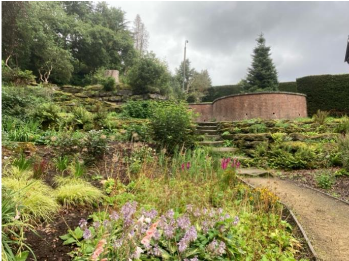
Recently restored rock garden and shrub beds

court and pavilion were added (no longer extant). The walled garden was used as a council depot and was laid with tarmac. The terraces were repaired in 1971 and yew and berberis were planted. In the 1980s the beech trees on the north wall were replaced and the wall was repaired. Two car parks were added.