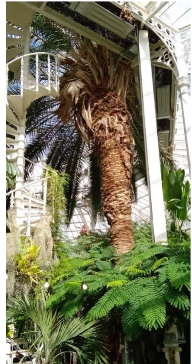
The Canary Island Date Palm climbing to the roof of the Palm house