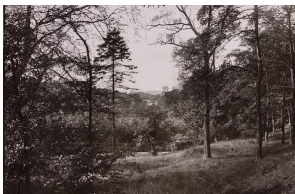
Photograph of Taxal Woods, 1926

The whole estate was put up for sale by auction on 23 June 1831 as one lot (Leeds Intelligencer, 19 May), however it failed to find a buyer and instead was offered in 28 lots on 4 January 1832 (Sheffield Archives, FC/P/Tax/1L). Taxal Lodge and its immediate surroundings again did not sell and by 1836, it had been demolished with its building materials sold off (Macclesfield Courier and Herald, 4 June). The Jodrell family continued to own the land including the large plantations to the west until well into the 20th century (see photograph right).