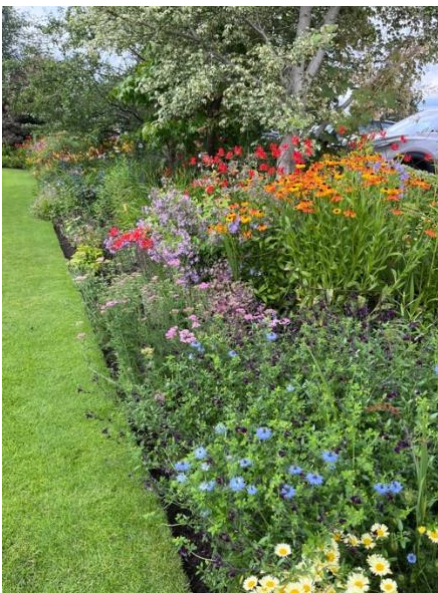
One of the many colourful herbaceous borders

Wendy, originally an art teacher who retrained in garden design at