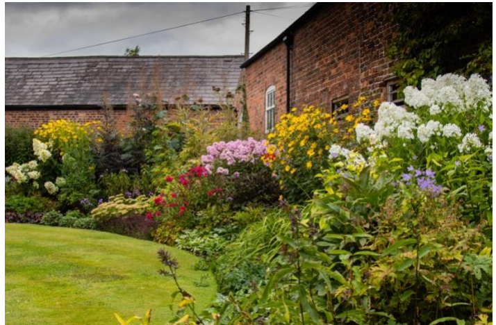
Colourful herbaceous border

Martin and Kate's garden holds much to interest gardeners with spacious lawns, carefully-sited exotic trees, colourful island beds and herbaceous borders, and a maturing wildlife pond and fountain. Beyond the immediate garden visitors could see an array of attractive fruit in the orchard and vegetables in the kitchen garden, a wildflower meadow looking over the adjacent valley and a mature woodland with 'Fairy Houses' carved in old trees (see below).