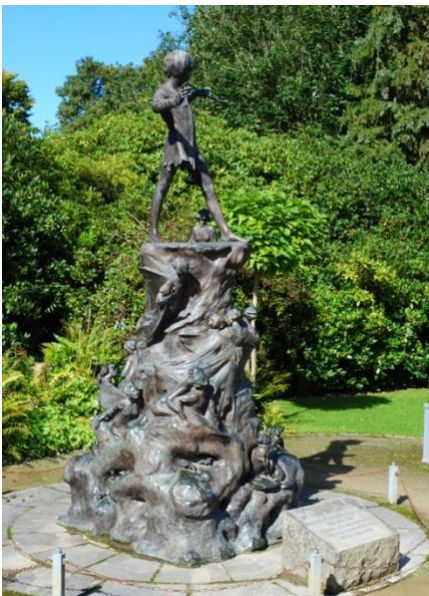
The Peter Pan statue outside the Palm House

Joseph Paxton on Birkenhead Park, got the contract.