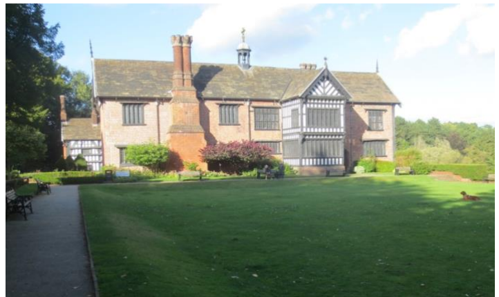
Enclosed lawn area

Currently the park is looked after by a Facilities Park Manager and ground maintenance team from the Totally Local Company (TLC), who won an award in 2022. In addition there is an active Friends group for the Hall and Park (formed in 1947). They have recently restored the rock garden and planted shrub beds at the foot of the slope (above). A new planting bed has been created beside the drive near the entrance from Bramhall Green.