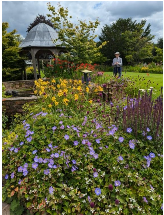
Vibrant colours in the garden

The Platt family has been associated with the farm for well over 100 years, first as tenants on a working farm. Then, in the 1950s, the farm buildings were converted into commercial premises which are still in use today, providing a pleasant rural location for a number of thriving small businesses.