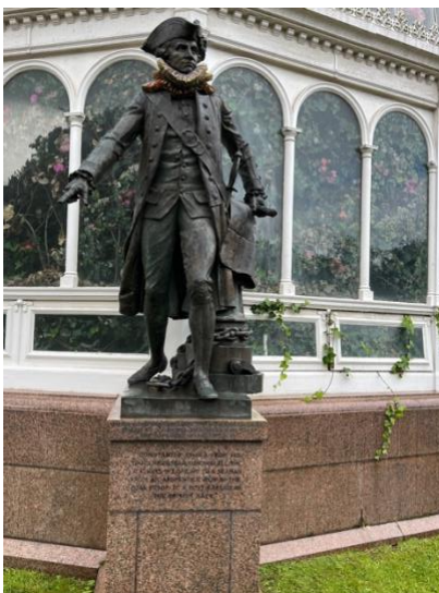
Captain Cook with his ruff

the glasshouse. Charles Darwin, Carl Linnaeus, Prince Henry the Navigator, Christopher Columbus, Captain James Cook, Gerardus Mercator, John Parkinson and André le Nôtre, were chosen to represent the Victorian passion for exploration, scientific discovery and learning. Views change. Three of the people